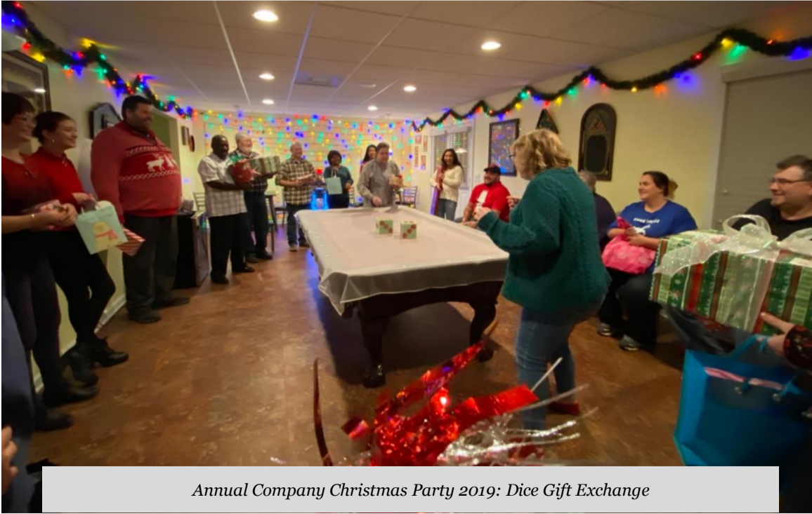
Annual Company Christmas Party 2019: Dice Gift Exchange

AMR has responded to these complaints by ensuring they have “instituted new policies and training that will help improve AMR’s response times”. After searching for other vendors and options this past year, Dekalb county has decided to renew its contract with AMR for the next 5 years. Source: DeKalb County recommends new 5-year contract with highly-criticized ambulance company AMR. (2019, November 20). Retrieved from https://www.11alive.com/article/news/local/dekalb-county-recommends-new-contract-with-highly-criticized-ambulance-company-amr/85-25e673be-1aeb-470f-a1a9-74181099690 .