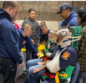
Oct AEMT 2019 Class

Just like our current classes, the paramedic program will be for the student and for the public. The class will be created to produce quality paramedics while offering a flexible schedule so that students will still be able to live their life. The main goal for the school is to better our community.